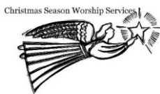
Christmas Season Worship Services

Here at Bethany Lutheran School, we don't do gift exchanges at our Christmas parties. Instead we prepare individual Personal Hygiene Kits for distribution by Lutheran Social Services of Long Beach. Each kit is a gallon zip lock bag containing: a bar of soap, a washcloth, a tube of toothpaste, a toothbrush, a small size shampoo & a comb.